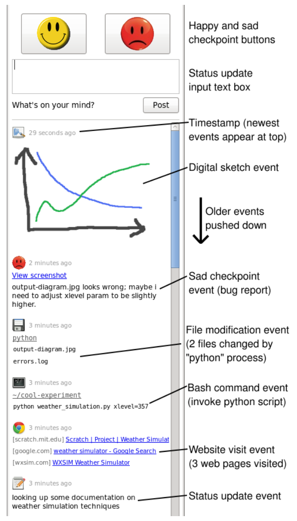
Figure 2: The Activity Feed resides on the desktop background and shows a near real-time stream of user actions.